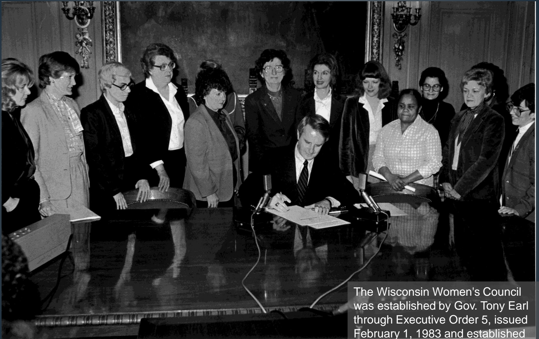
The Wisconsin Women's Council was established by Gov. Tony Earl through Executive Order 5, issued February 1, 1983 and established in statute in 1983 Wisconsin Act 27.