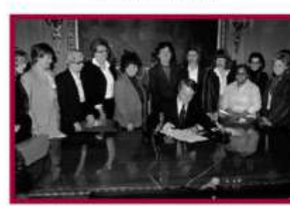
Women's Council And

The Council has a 15member board appointed by the Governor and Legislative Leadership.