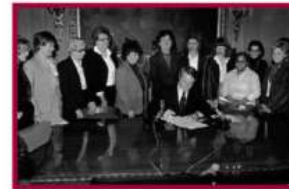
Women's Council And

When Seeking Status for Women It's No Time to Be Ladylike WISCONSIN STATE JOURNAL-OCTOBER, 1965