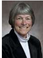
Senator Janis Ringhand 15th Senate District Evansville