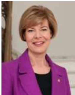
U.S. Senator Tammy Baldwin

October 20, 2014 Edgewater Hotel Madison, Wisconsin