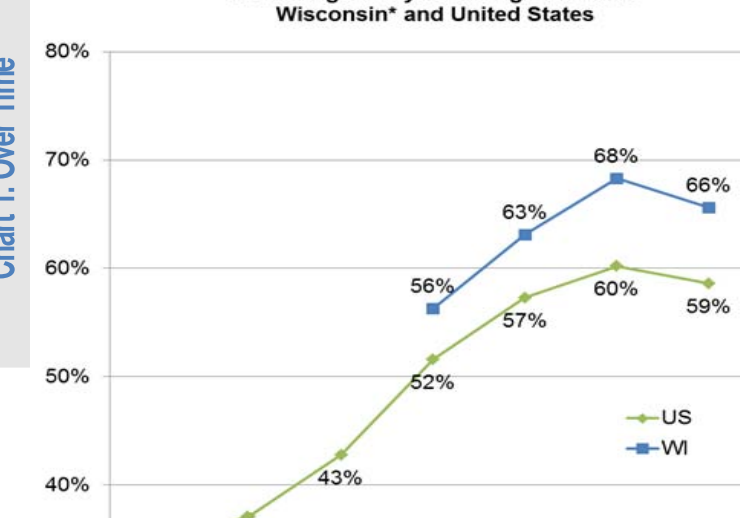
Chart 1. Over Time