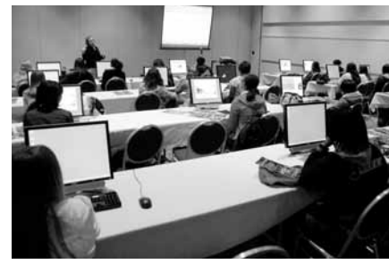
WCATY "Virtual World" Computer Lab