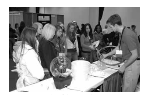
UW-Madison "Wonders of Physics" Booth